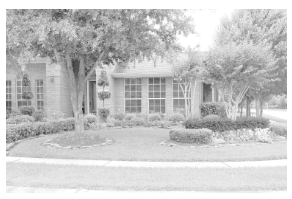
Category I winner for July is 5611 Lake Place Drive

Thank you for all your efforts in keeping our community beautiful!!