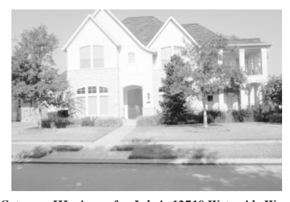
Category III winner for July is 12718 Waterside Way