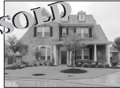
12407 Mossy Woods Drive