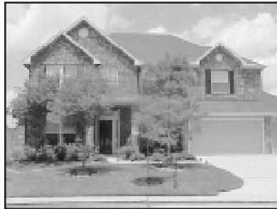
17307 Village Breeze Drive