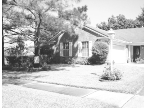
10314 Wayward Wind