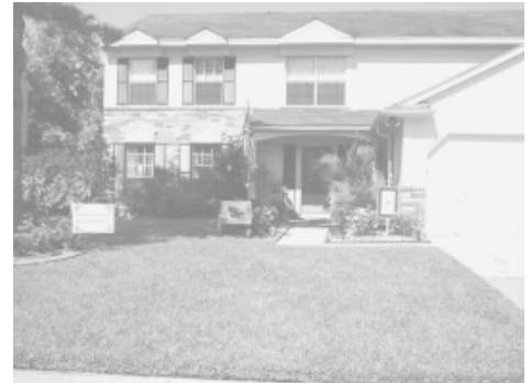
9523 Cabin Creek

I would appreciate any assistance you might have to nominate your neighbor for Yard of the Month. It is very difficult to pick Yards each month. So if you know someone who deserves Yard of the Month please let me know by e-mailing me at wincountry@ev1.net .