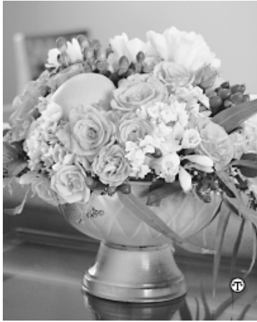
Autumn rides in on the coattails of summer, then slips away while our heads are turned.

For more ideas about how to use flowers in your home, visit www.flowerpossibilities.com .