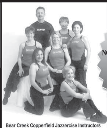
Bear Creek Copperfield Jazzercise Instructors