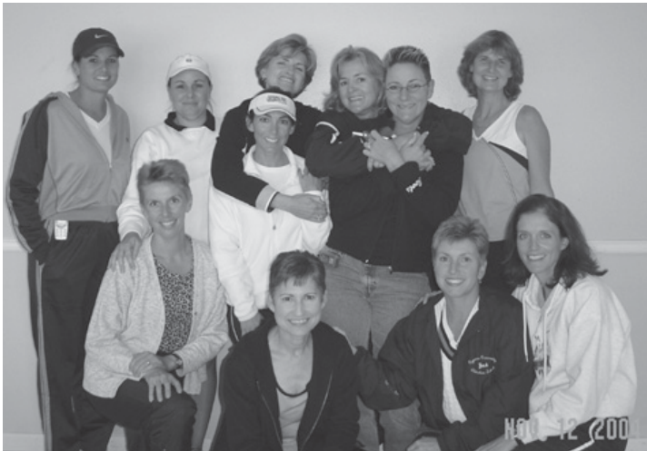
Texas Jackrabbit League B Team:

Wortham Villages has two tennis teams in the Texas Jackrabbit League which play every Friday. One team is in the B level and the other is in the D level. The fall season provided some nice weather for playing tennis. Both teams celebrated the end of the another great season.