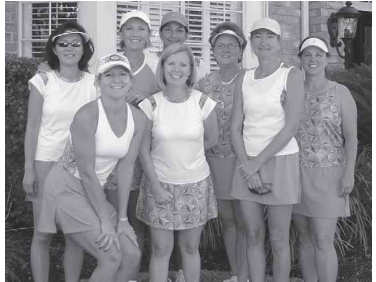
Texas Jackrabbit League D team: