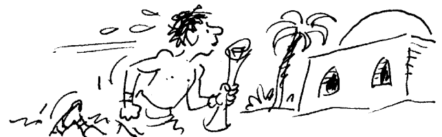
The name of the prophet Malachi comes from the Hebrew words for my messenger.

If you are looking for a chance to volunteer for your community I want to pass on a great website I have come across. It is at www.volunteermatch.com , it has a wide variety of every volunteer opportunity possible. It is a chance to get you and your children active in our community. If you are interested in applying your skills and knowledge to make a difference please go to the site and check it out. Also I know Tomball schools are in need of tutors for children, please contact the schools directly for volunteer information.