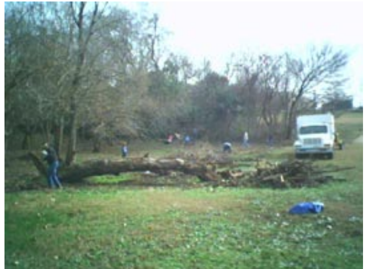
Perry Park Clean-Up

Removing brush, bamboo, and trash was our focus for this cleanup, and you can see a big difference. But we are not finished. More Perry Park workdays are being planned to give this park the attention it needs. Thanks to everyone who helped out. Your efforts made a big difference! (Note: The workday did not involve the running trail. Improvements to the running trail are the focus of the Highland Park PTA, which is working with drainage and trail experts for solutions.)