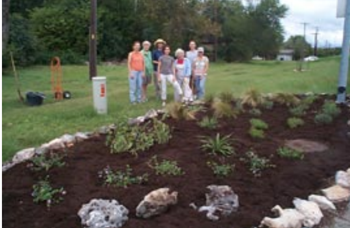
Volunteers and new landscaping at the Hancock bridge

The Hancock bridge area is looking great these days with new landscaping at the southwest corner of Hancock Dr. and W. Frances Place. After the HPWBANA Beautification Committee worked for several, yes several, months with the City of Austin staff, our persistence paid off and we obtained approval to improve the area. The native perennials and trees we planted last October will provide seasonal color and shade in years to come.