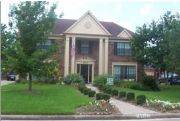
Alison Poor 8915 Red Cloud