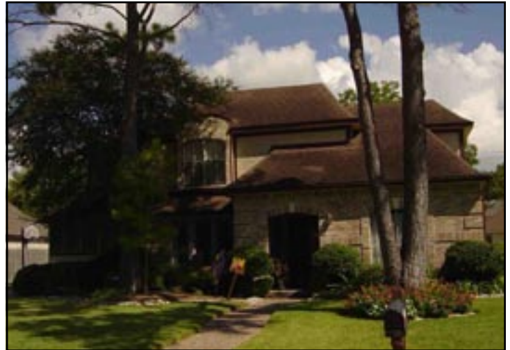
Susie Gullo 10314 Gold Point Drive