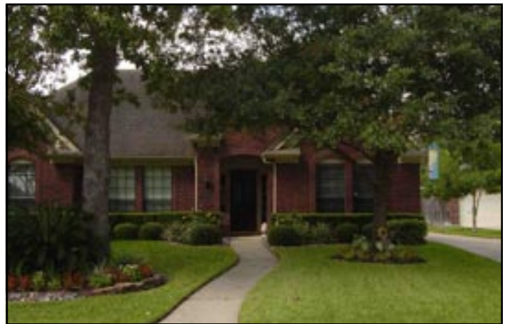
Kelly & Denise Sherrill 8103 Crazy Horse Trail