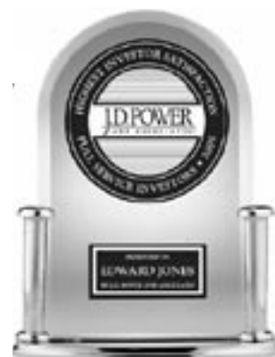
Edward Jones ranked "Highest in Investor Satisfaction With Full Service Brokerage Firms"

If you'd like to experience exceptional personal service, consider Edward Jones. We offer solutions for all your financial needs. Get to know us.