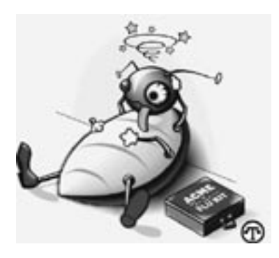
Myth 2: Antibiotics can cure the flu.

Flu vaccines are not live viruses and cannot give you the flu. But some people may have reactions to the shot or inhalation, including achy muscles, fever and drowsiness.