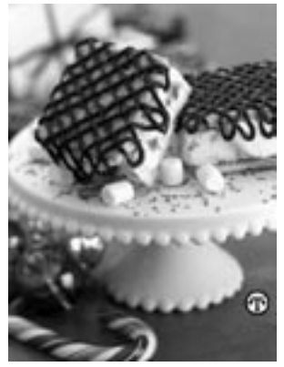
Kids and adults alike will love Peppermint S'mores.

(NAPSA)-Nothing sums up the sweet spirit of the season quite like a frosty peppermint dessert.