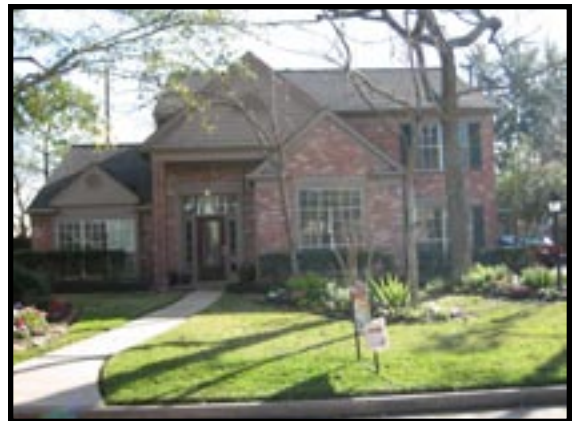
8914 Crazy Horse Trail - Alex & Lynn Watt

View the Winchester Trails Trailwriter each month on-line at www.PEELinc.com