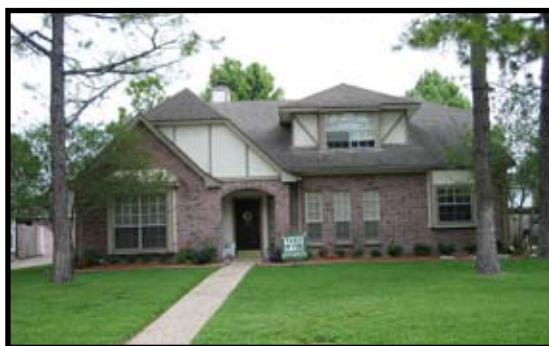
10406 Wagon Trail Road - Kyle and Kelley Nesbitt