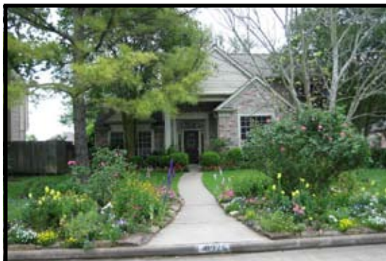
8926 Crazy Horse Trail - Bill and Sally Patin