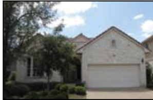
6215 Tasajillo Exclusive Gated Community, Pristine Granite Countertops, 2 Huge Master Suites

"We aren't just your neighborhood specialists, we're YOUR neighbors!"