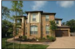
7008 Cusseta Cove Custom Built Dr Horton, Stunning Hardwood Floors, Dramatic Vaulted Ceilings