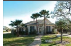
5701 Ballenton Court David Weekley's Medford Plan, Lush Landscaping, Gleaming Hardwood Floors, Many Upgrades!