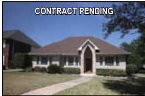
10611 Ames Lane Newmark Home's San Antonio Plan, Gorgeous Crown Molding, Phenomenal Corner Lot