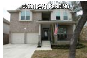
10105 Hibiscus Cove Breathtaking Drive-Up Appeal, Elegant French Doors, Stunning Vaulted Ceilings

Your home has gone up in value! Call Jaymes today for a Free Market Analysis!