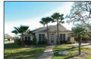
5701 Ballenton Court

Cove Custom Built Dr Horton, Stunning Hardwood Floors, Dramatic Vaulted Ceilings