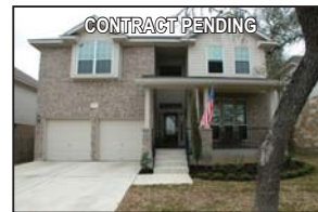
10105 Hibiscus Cove

Newmark Home's San Antonio Plan, Gorgeous Crown Molding, Phenomenal Corner Lot