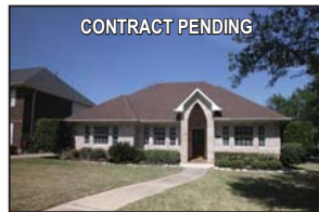
10611 Ames Lane

David Weekley's Medford Plan, Lush Landscaping, Gleaming Hardwood Floors, Many Upgrades!