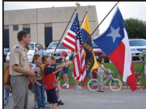
Boy Scout Pack 59 Prepares for the HPWBANA Parade

Judges reportedly had a tough job deciding winners of the bikes, tricycles, scooters and other wheeled vehicles. The competition was especially stiff this year and everyone is to be congratulated on their fine entries! Congratulations to winners in all categories.