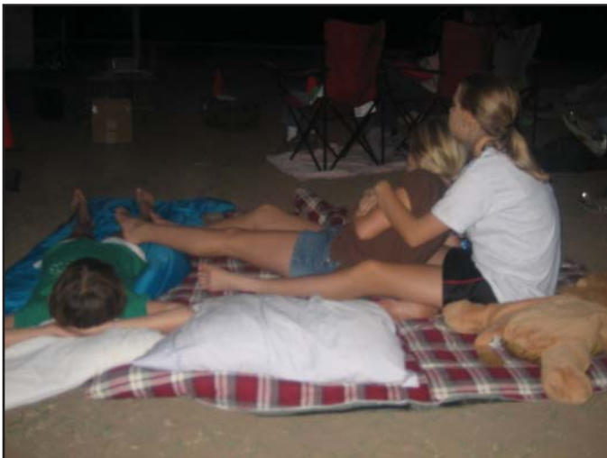
Friends get comfortable watching the movie!