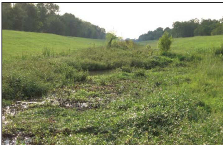
Linear Retention Channel behind Willowbridge