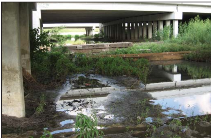
Passage cut under Beltway 8

The Linear Retention Channel that runs north-south between Willowbridge & Westbridge is be planted with trees by Harris County Flood Control.