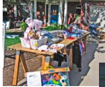
Kids growing, time to empty closets