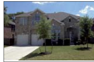
313 Pedigree Dr. SOLD in 15 days!