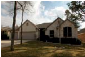
11539 Arbor Downs Rd. SOLD in 18 days!