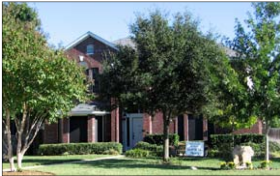
Corner lot reflects years of care

Who will be our next Yard of the Month winners? See the "You Make Us Look Good" ballot in this issue and let us know what you think.