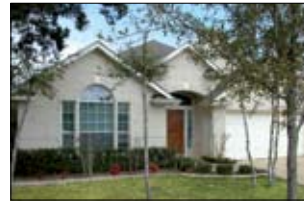
5624 Sunny Vista Dr. SOLD in 21 days!

"We aren't just your neighborhood specialists, we're YOUR neighbors!"