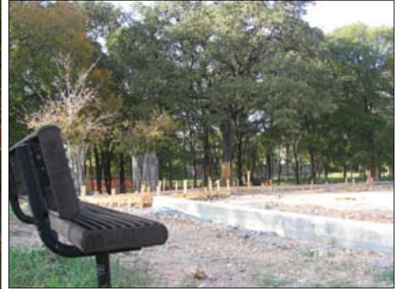
Aging bench awaits a new view