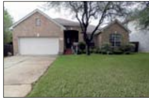
10707 Galsworthy SOLD in 4 days!