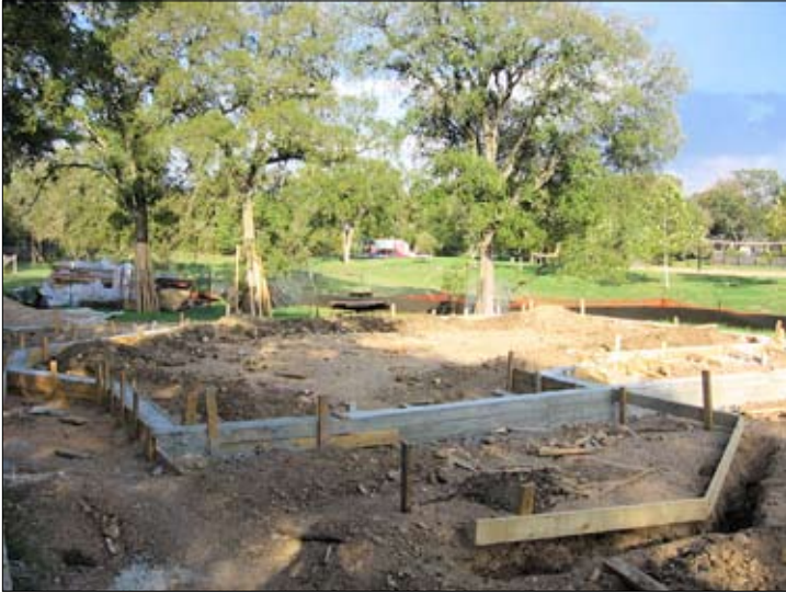
The shape of playscapes to come (See photos in full color at www.peelinc.com )