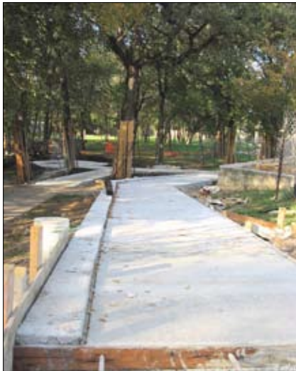
New sidewalk leads into the trees