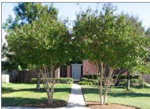
Trees gracefully frame the entrance walk

See photos in full color at http://www.peelinc.com/newsletterInfo.php?newsletter=CR