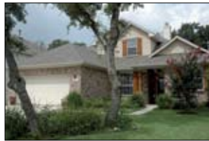
6013 York Bridge Circle SOLD in 7 days!