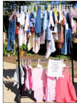
We thought it was buy hanger, get free shirt