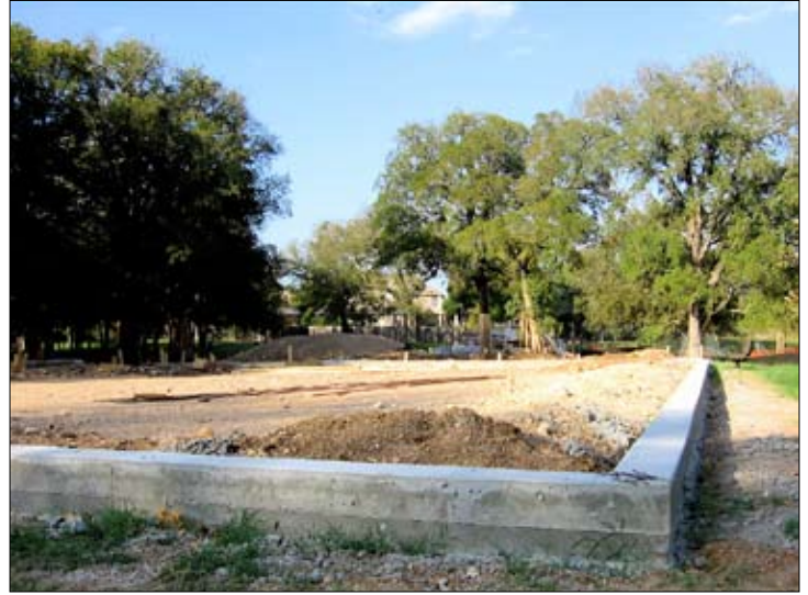
Fresh curb marks upper play area