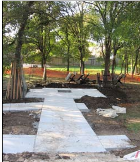
Old stone meets new concrete ramp