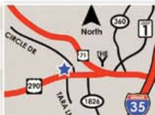
just west of The Y.