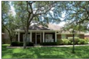
4005 Idalia Dr. SOLD in 13 days!