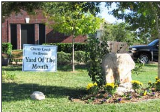
Eye-catching bed anchors the yard's corner