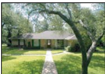
7609 Crossmeadow Dr. SOLD in just 26 days!

On average, we sell our homes for 99% of their list price!