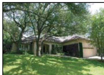
4301 Aqua Verde Dr. SOLD in just 17 days!