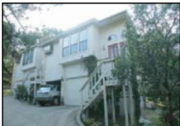
1895 Westlake Dr. #104 SOLD in the heart of Westlake!