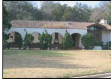
7608 Creekbluff SOLD in just 1 day! Sold for 100% of list price!

Your home HAS increased in value! Please call Jaymes for a free Market Analysis!