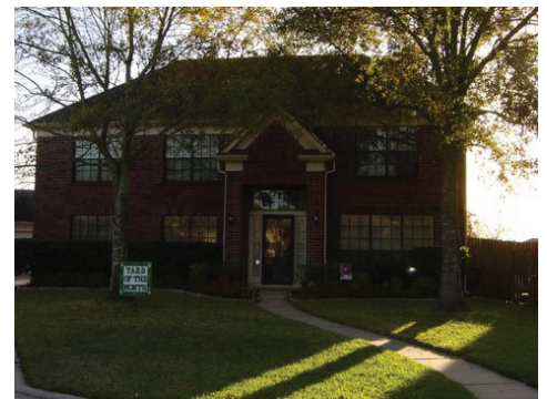
10503 Gold Point – Pat & Sheryl O'Briant