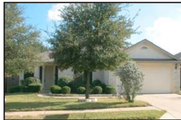
8657 Barrow Glen Loop SOLD in 8 Days! As seen on The Open House Show!