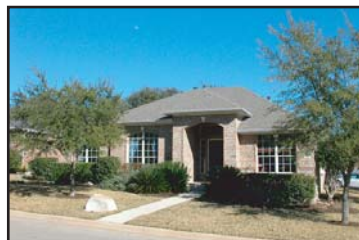
9321 Colberg Dr. FOR SALE! List Price 244,900 As seen on The Open House Show.