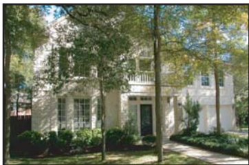
10019 Austral Cv. FOR SALE! List Price 369,900 As seen on The Open House Show.