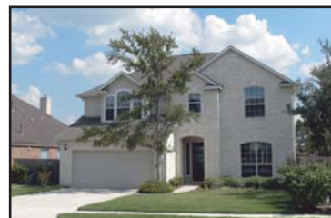
10509 Hansa Dr. FOR SALE! List Price 319,900 As seen on The Open House Show.

"We aren't just your neighborhood specialists, we're YOUR neighbors!"