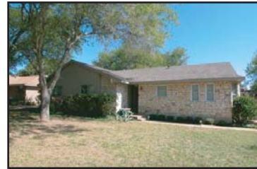
5306 Beckett SOLD in 15 days!