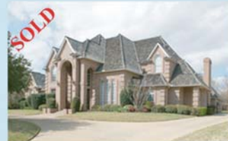
2904 Meadowview Dr.—Brook Meadows Colleyville—$489,900 4BR, 4.1BA, Pool & Spa, 2 Liv. areas