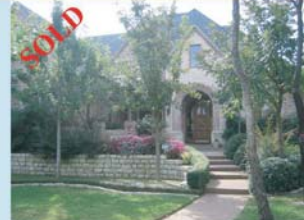
2617 Independence.—Heritage Colony Colleyville—$749,500 5BR, 5.1 Baths, 4 Living, Pool & Spa