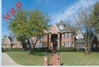
2500 Valley Ridge.—Thornbury Colleyville—$699,000 4BR, 3.1 Baths, 3 Living, Pool & Spa