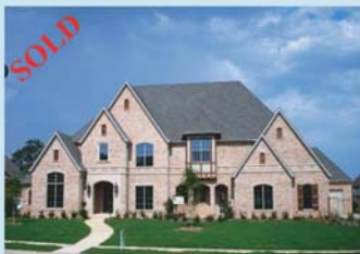
6100 Mustang Trail.—Remington Park Colleyville—$875,000 5BR, 5.1 Baths, 4 Living