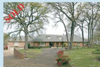
3000 Sherwood.—Brighton Oaks Colleyville—$1,085,000 5BR, 5 Full BA, Game & Media Room