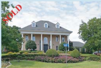
4401 Shadycreek Lane.—Brook Meadows Colleyville—$509,500 4BR, 3.1 Baths, 4 Car, Pool & Spa