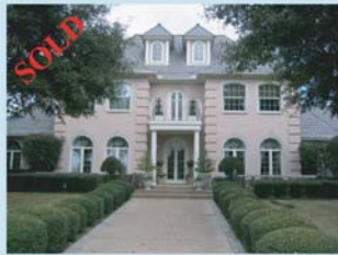
2900 Meadowview Dr.—Brook Meadows Colleyville—$539,000 4BR, 4.1 Baths, 3 Living, Media Room