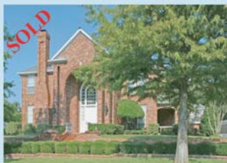
4700 Lakeside Dr.—Thornbury Estates Colleyville—$656,000 5BR, 4.1 Baths, 3 Living, Pool & Spa