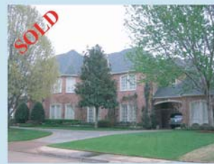
4419 Meandering Way.—Thornbury Colleyville—$1,235,000 4BR, 4.2 Baths, 3 Car, Game Rm, Media