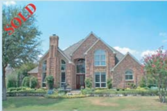
4604 Green Oaks Dr.—Brook Meadows Colleyville—$549,000 4BR, 4 Baths, 2 Living, Pool & Spa