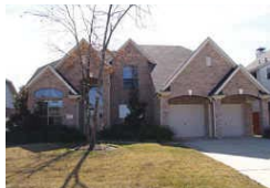
16015 Mustang Glenn - 4/3.5/3 A STABLEWOOD FARMS - $259,000.