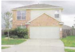
19619 Tigris Springs - 3/2.5/2 A WESTFIELD - $129,900