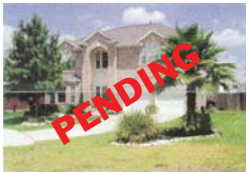
11702 Canyon Vista - 4/2.5/2 A CANYON GATE - $179,900