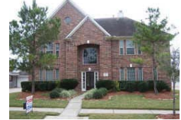
20315 Lakeland Falls - 5/3.5/3 D FAIRFIELD - $259,900