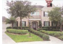
20419 Lake Spring Ct. - 5/3.5/3 D FAIRFIELD - $299,000