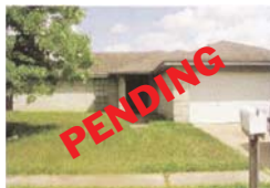
22106 Manor Estates - 3/2/2 A WESTLAND CREEK - $86,000