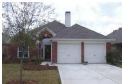
20511 Orchid Blossom - 3/2/2 A FAIRFIELD - $164,900