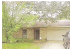
4427 Kacee - 3/2/2 A GLENCAIRN - $79,900