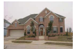
18627 Gail Shore - 4/3.5/2 A BRIDGELAND - $366,550