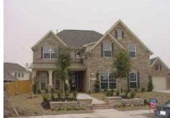
18519 Juniors Map - 5/3.5/3A BRIDGELAND - $418,726