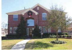
15606 Brookchase - 4/3.5/3+D FAIRFIELD - $264,900