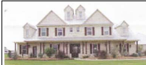
20603 Flagstone Trail - 6/4.5/3 D - Saddle Ridge Estates - $1,095,000