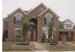
18503 Juniors Map - 4/3.5/2 A BRIDGELAND - $385,573