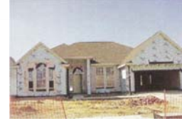
21903 Red Ashberry - 4/2.5/2 A FAIRFIELD - $219,055