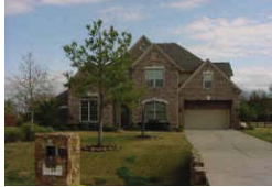
46 Highclere - 5/3.5/3 A GLEANNLOCH FARMS - $630,000