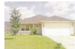
19606 Plantation Grove - 3/2/2 A PLANTATION LAKES - $104,900

email: don.jeanne@realtor.com www.realtor.com/houston/donandjeanne