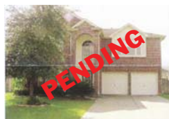
3618 Emerald Bay - 4/2.5/2 A LAKES OF BRIDGEWATER - $142,900