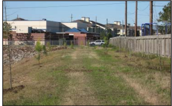
Trees along the bayou

While I was biking down the bayou one day, I noticed that there were new trees being planted so I decided to figure out what is going on. I found out that the HCFCDD had placed Pine, Redbud and Bald Cypress trees along the bayou. They did this to control the weed population and at the same time beautify the area.