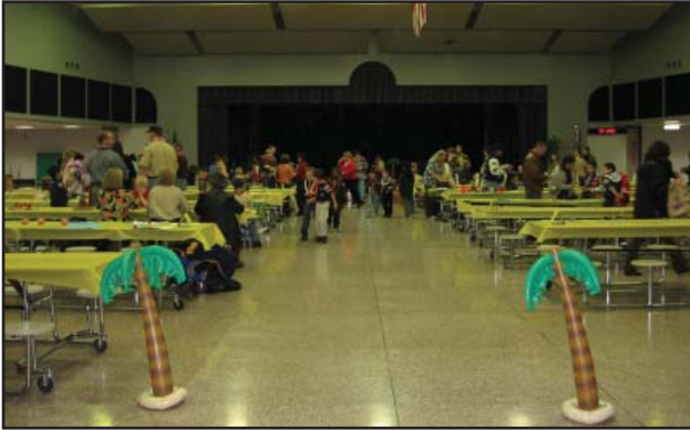
Cub Scouts at Blue & Gold Banquet

Ever since I started in the Cub Scouts, I have been excited about the Blue & Gold Banquet. It is one of the best events in Cub Scouting. It has a silent auction with desserts. It has spaghetti or bar-b-que. And it is the time when you get the most awards. Everyone works harder when it comes to the Blue& Gold Banquet. Plus all of the Cub Scouts love showing off that it is the Cub Scouting anniversary. It occurs every year on the same date at Cook Middle School and everyone looks forward to it.