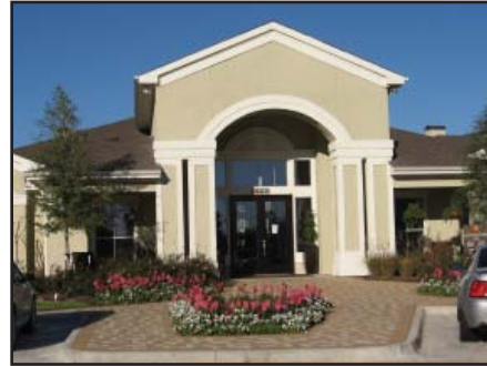
Villas at West Road

When they started building the apartments instead of a park, I was pretty mad but when they finished them, I changed my mind and said to myself, this would be a pretty good article so I started to check them out and this is what I found.