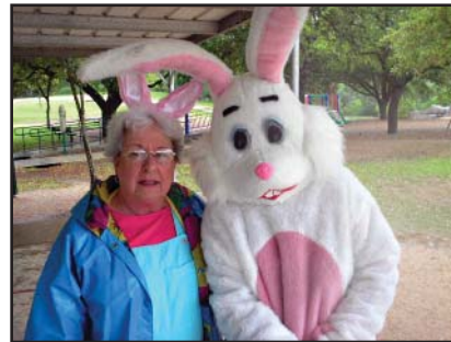
Former HPWBANA President and current HPWBANA President-oops— The Easter Bunny!

Neither rain, nor sleet, nor cold could keep the egg hunters from finding the eggs hidden at Perry Park! Thanks and congratulations to the many volunteers and participants who helped make the Annual Perry Park Egg Hunt a fantastic success. No one could have predicted the terrible weather we would have to deal with AND no one could have predicted that so many families would