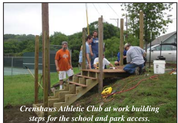
Crenshaws Athletic Club at work building steps for the school and park access.