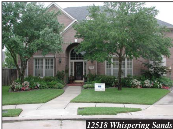
12518 Whispering Sands