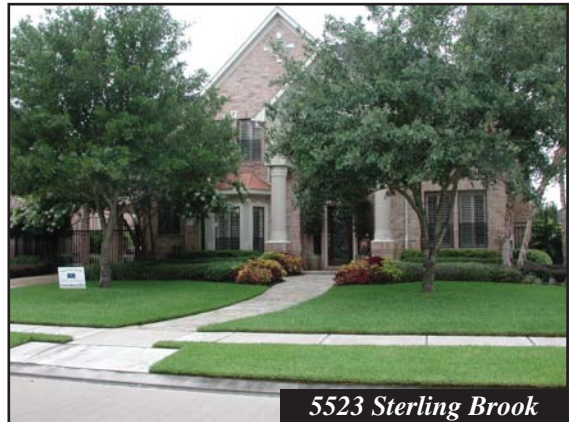
5523 Sterling Brook

Congratulations to the winners of June Yard of the Month!