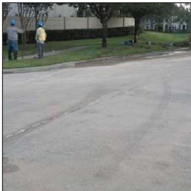
A resident lost control of her vehicle hitting 2 trees and a fire hydrant.

In the recent past there have been several articles in this newsletter asking residents to drive more carefully. For the most part, LOE residents do drive the speed limit (25mph), stop at the stop signs and obey basic traffic laws on our streets. For a very small percentage of residents, none of this pleading seems to have made one bit of difference. If you find yourself not coming to a complete stop at a stop sign or driving in excess of the posted speed limit of 25mph, you are driving recklessly. If you have children, and you truly love them, look at the kind of example you are setting for your children. Children learn by example.