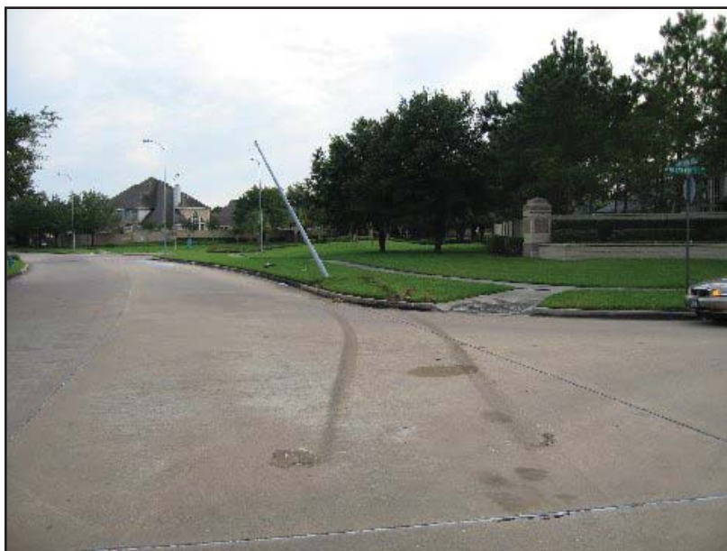
A guest in LOE lost control of his vehicle hitting a lightpole on Lakeshore Ridge near the entrance gate.