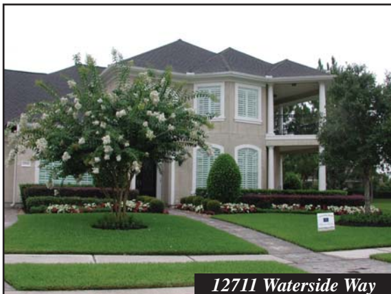
12711 Waterside Way