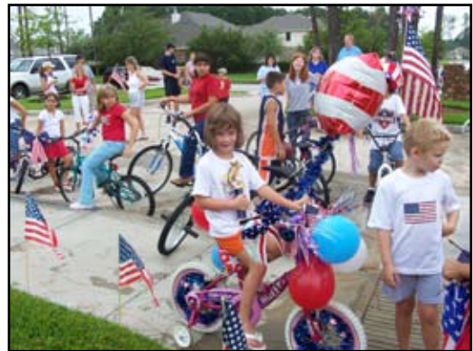
From last year's 4th of July Parade

Following the parade will be fun and games at the pool. Don't forget your swimsuit! This is sure to be fun for the whole family!