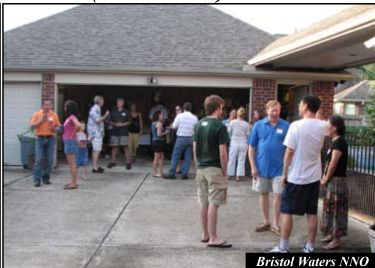
Bristol Waters NNO

National Night Out- (Continued from Cover page) the patrol car.