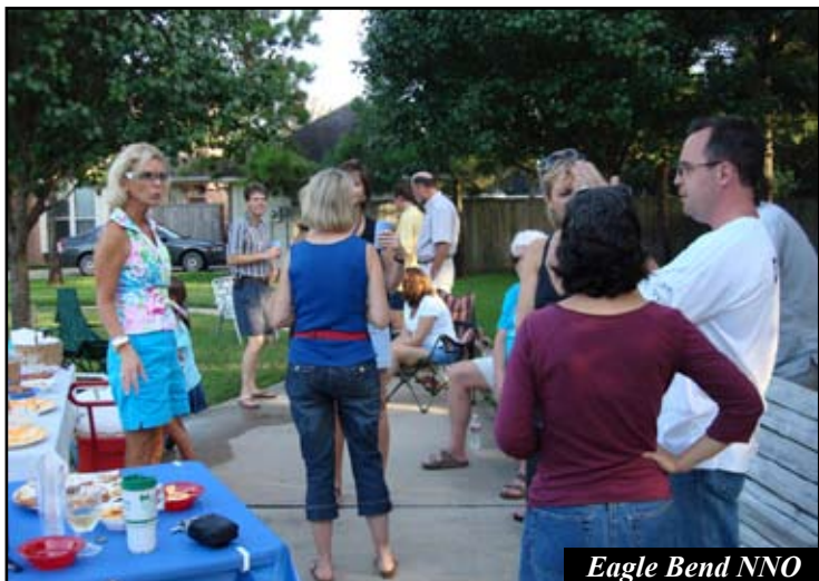
Eagle Bend NNO