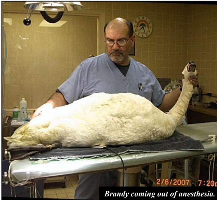
Brandy coming out of anesthesia.

The picture below is that of Brandy coming out of anesthesia after having his foot sewn back together. He stepped on a broken glass bottle in one of our lakes and almost bled to death.