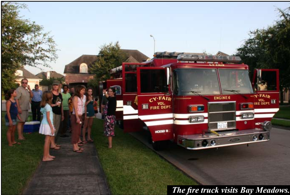
The fire truck visits Bay Meadows.