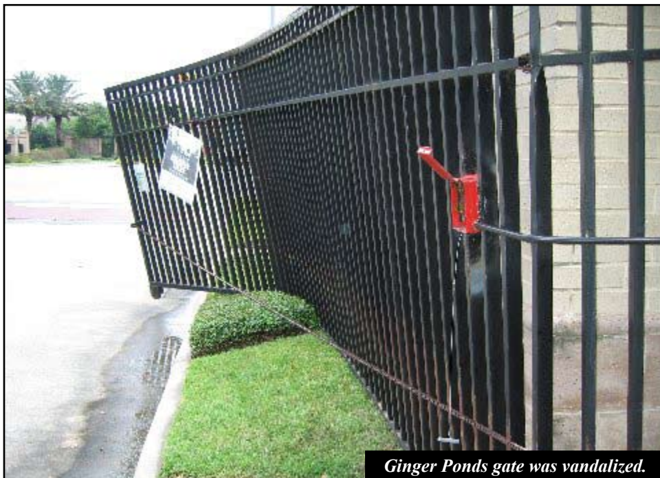
Ginger Ponds gate was vandalized.

On Saturday morning, August 4th at 10 o'clock, the Ginger Ponds gate was found to have been seriously damaged by persons unknown. The exit gate was open, pulled 15 or 20 feet northward toward Tanner Road. The gate frame was bent and broken. It appears as though someone approached the gate from the outside, hooked onto the gate and pulled it physically off the tracks with great force. There were NO SCRATCH marks on the concrete as would be expected if the gate had been hit from inside LOE and pushed toward Tanner Rd. There was NO PAINT residue found on the gate as from a collision with a vehicle. Amazingly, the pull chain was still in place, although stretched