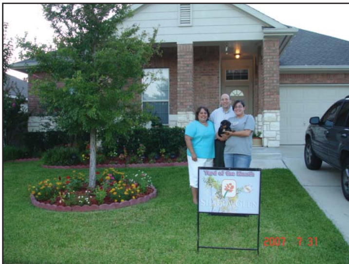
Meadow Glen – 11508 Knapple