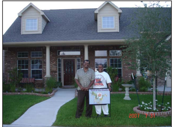
Fieldstone – 11308 Terrace Meadow