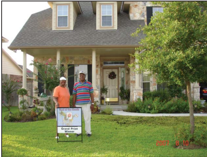
*Grand Prize Winner* - Meadow Ridge – 13705 Shady Ridge

We encourage you to walk or drive by each home to see home in person! - ShadowGlen Landscape Committee