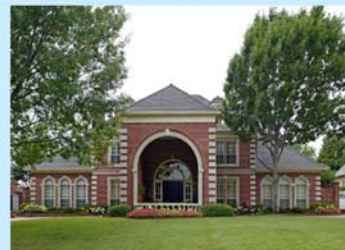
4608 Cresthaven Dr.—Thornbury Estates SOLD