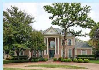
4907 Cranbrook Ct.—Cranbrook SOLD