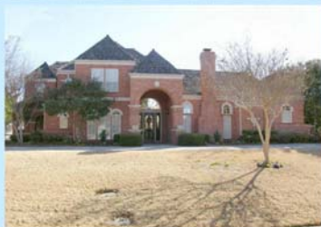
4901 Green Oaks Dr.—Brook Meadows SOLD