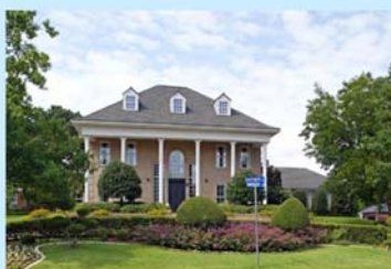
4401 Shadycreek Lane—Brook Meadows SOLD