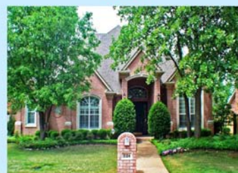
3124 Woodland Heights—Woodland Hills SOLD

Certified Home Marketing Specialist—Certified Relocation Specialist