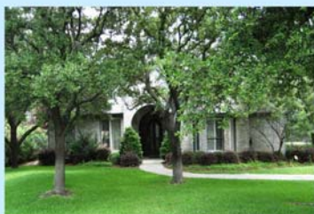
4105 Martin Pkwy.—Woodland Hills SOLD