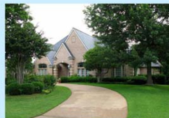
1300 Alexandra Ct.—Lakes of Somerset SOLD