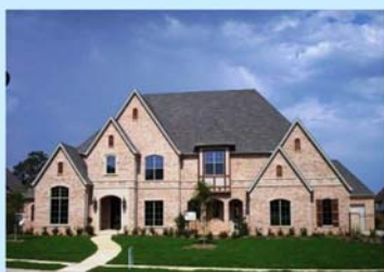
6100 Mustang Trail—Remington Park SOLD