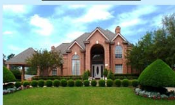
4704 Cresthaven Dr.—Thornbury Estates SOLD