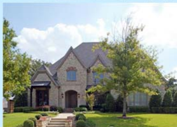
2405 Carlisle Ave.—Leyton Grove SOLD