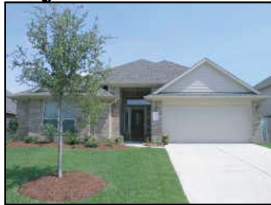
12614 Twin Flower