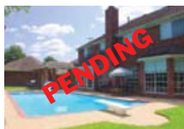
20602 Cascading Brook Ct - 5/3.5/3 D FAIRFIELD - $299,900