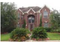
20303 Lakeland Falls, 5/3.5/3 D, FAIRFIELD, $295,000