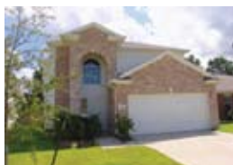
11011 Northam Dr, 3/2.5/2 A, Pool, ASHFORD PLACE, $144,900.