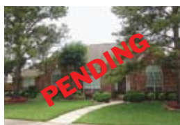
14910 Vista Heights, 3or4/2/2D, FAIRFIELD, $234,900