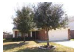
5422 Misty Dawn - 4/2.5/2 A FAIRFIELD - $159,900