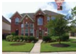
20811 Twisted Leaf - 4/3.5/3 D FAIRFIELD - $317,500