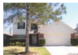
16411 Redbud Berry - 4/2.5/2 A FAIRFIELD - $144,900