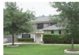
15406 Woodland Orchard - 4/2.5/2 A FAIRFIELD - $154,900