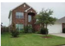
15326 Sienna Oak - 4/2.5/2 A FAIRFIELD - $159,500