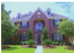
20203 Prim Pine Ct, 4/3.5/3 D, Pool, FAIRFIELD, $339,900