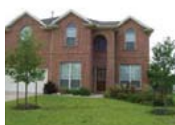
17611 Mossy Brook, 4/2.5/2+A, BARKERS LAKE, $199,900