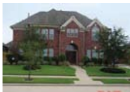
15910 Crooked Lake Way - 4/3.5/3 D FAIRFIELD - $310,000