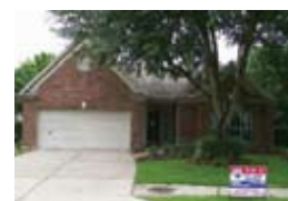
18206 Auburn Woods, 4/2/2 A, CYPRESS MILL, $149,900

email: don.jeanne@realtor.com www.realtor.com/houston/donandjeanne