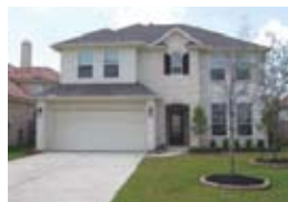
17811 Harbour Bridge, 4/2.5/2 A, SYDNEY HARBOUR, $299,900