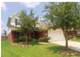
15303 Bronze Leaf Ct, 4/2.5/2 A, Pool, FAIRFIELD - $184,900