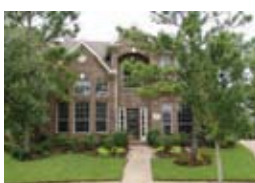
16003 Lake Loop, 5/3.5/3 D, FAIRFIELD, $329,900