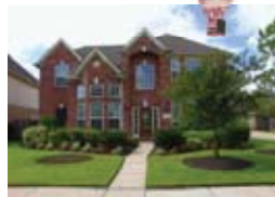
20811 Twisted Leaf - 4/3.5/3 D FAIRFIELD - $317,500