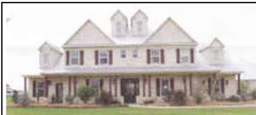
20603 Flagstone Trail - 6/4.5/3 D - Saddle Ridge Estates - $1,095,000