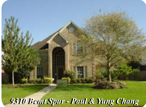
9310 Bent Spur - Paul & Yung Chang