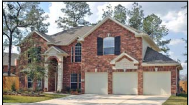
Ext. 86110 5Bd 3.5B 3G 3456 SqFt 14,030 SqFt Lot