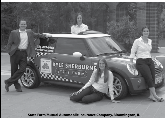
State Farm Mutual Automobile Insurance Company, Bloomington, IL

635 Rayford Rd., Ste B (next to KWAL Paint)