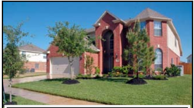
Ext 86120 4Bd 3.5B 2G 2897 SqFt Popular Model