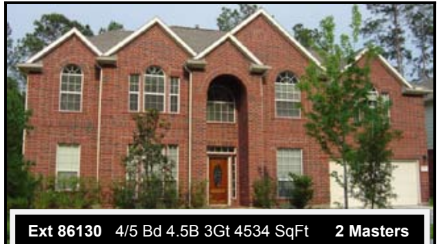
Ext 86130 4/5 Bd 4.5B 3Gt 4534 SqFt 2 Masters