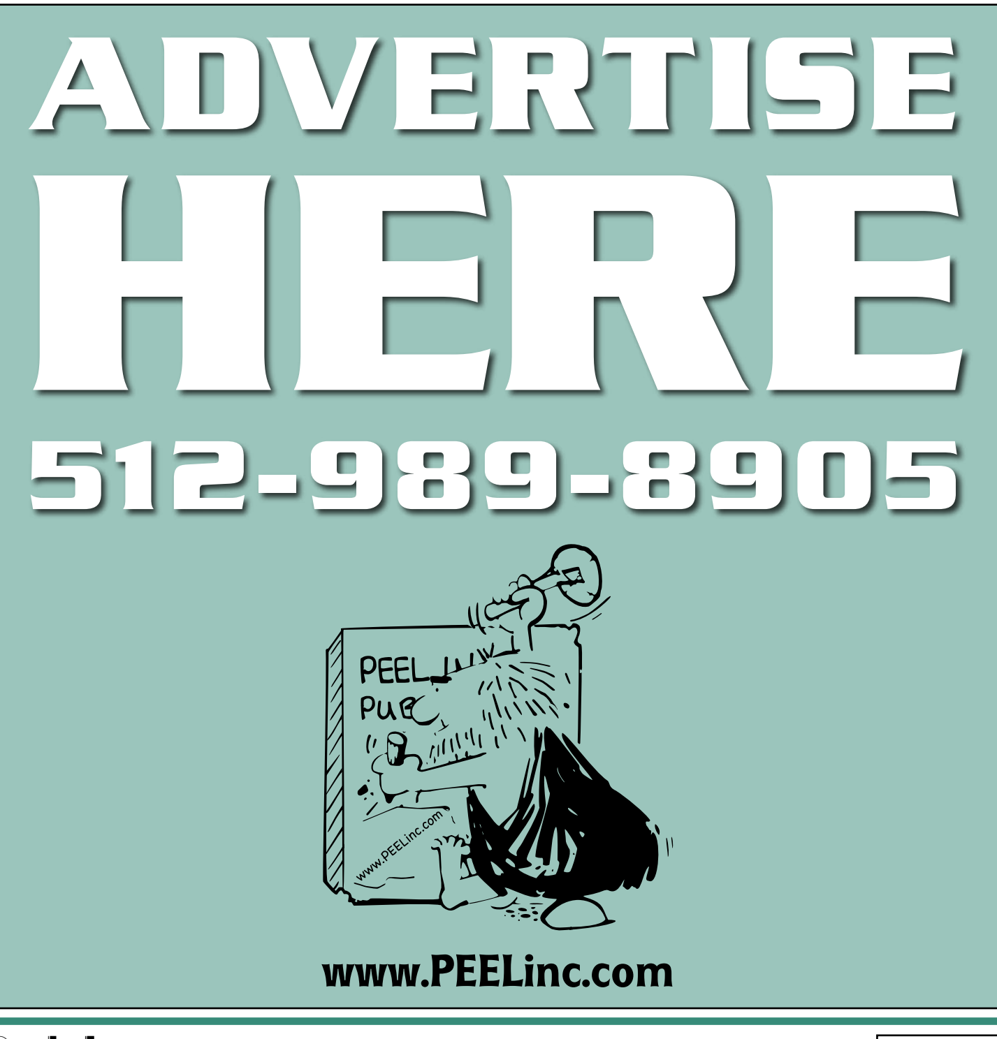
Deel, Inc. 203 W. Main Street, Suite D Pflugerville, Texas 78660