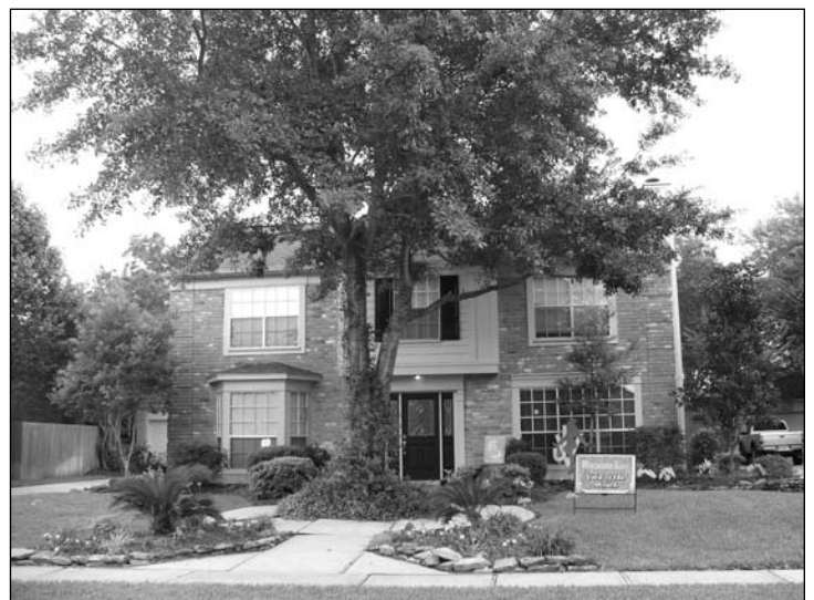
Back Section – Tom and Eileen Mace – 10315 Dude