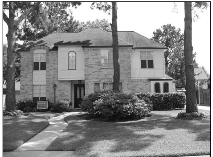
Front Section – Kip and Vickie Lawrence – 10607 Great Plains