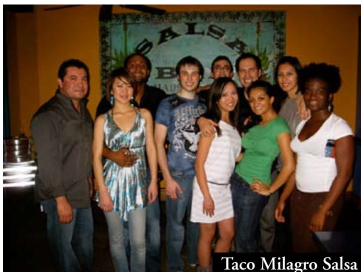
Taco Milagro Salsa