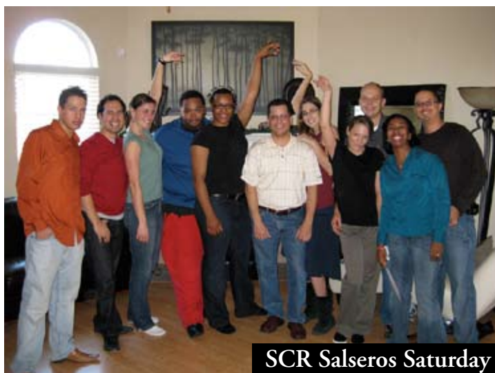
SCR Salseros Saturday