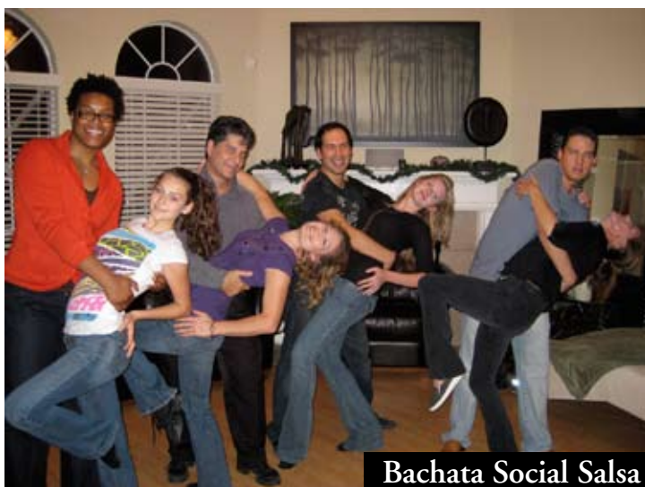
Bachata Social Salsa