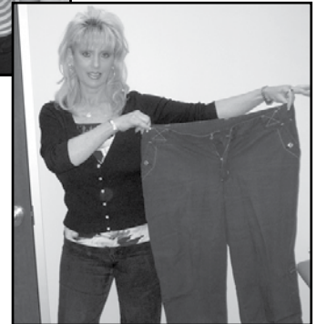
to a size 10