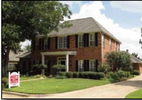
4803 EVERSHAM CT $439,900 4/3.1/3 BACKYARD DIVING POOL!