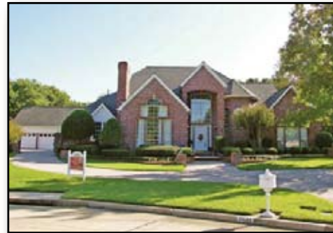
3531 CROSSGATE CIR $539,500 4/3.1/3 BACKYARD POOL & SPA!