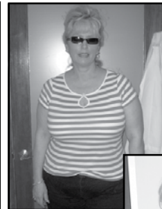
from a size 20

Bring This Ad For 10% OFF Weight Loss Program!