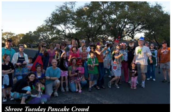
Shrove Tuesday Pancake Crowd