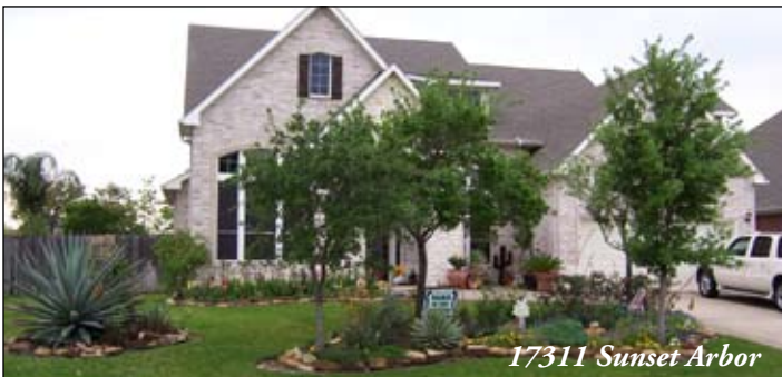
17311 Sunset Arbor