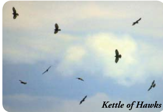
Kettle of Hawks

In order to get airborne and use these internal orientation systems, hawks find thermals, or large columns of warm air, and ride these rising air currents in a spiral, high into the sky. From this vantage point, they