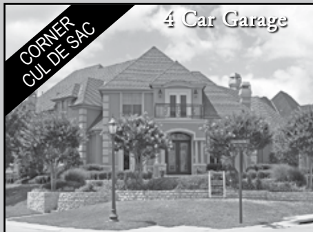
413 BRYN MEADOWS DR EAGLE BEND ESTATES, $900,000