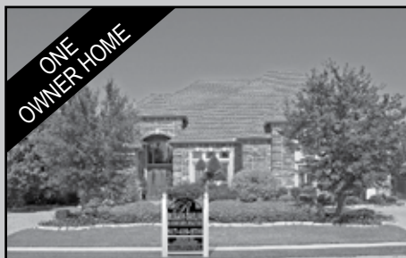
7305 THAMES TRL CASCADES AT TIMARRON, $650,000