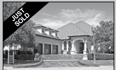
1327 REGENCY COURT CRESCENT ROYALE - WELCOME YOUR NEW NEIGHBORS