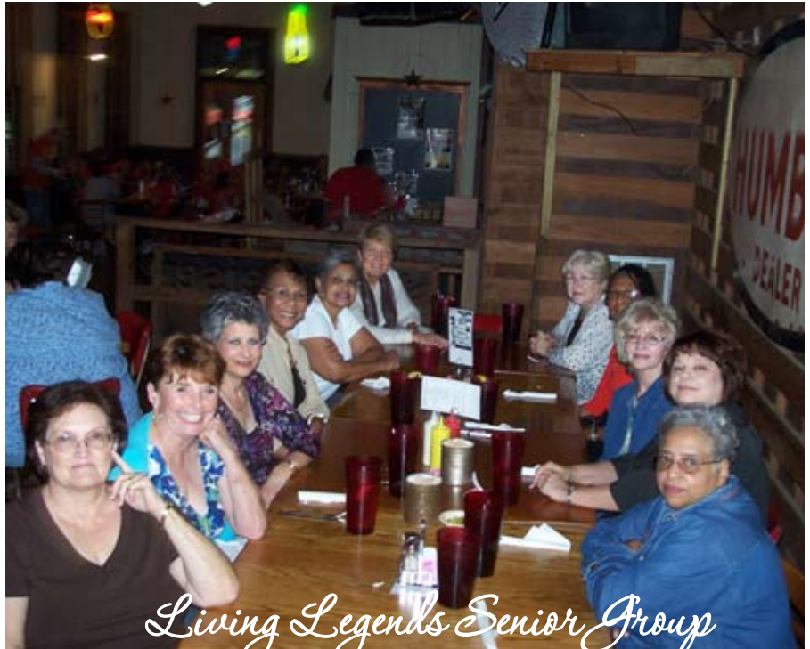
Living Legends Senior Group