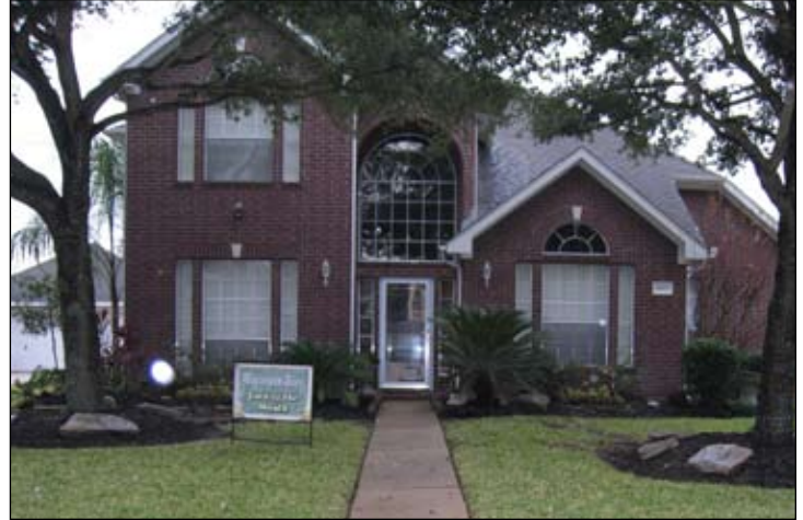
BACK SECTION Bill and Cathy Stolte 8903 Bent Spur Lane