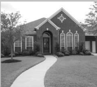
11518 CARSON FIELD LN.

Two-Story 4/3.5/4 Located in shady Garden Grove in Fairfield. Loaded with updates.