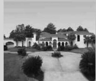
16121 STONE OAK EST. CT.