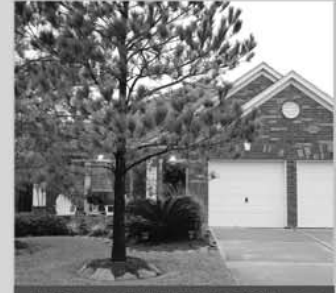
16215 LAVENDER CRK. CT.

25250 NW FREEWAY, SUITE 200 CYPRESS, TEXAS 77429 281.463.4131