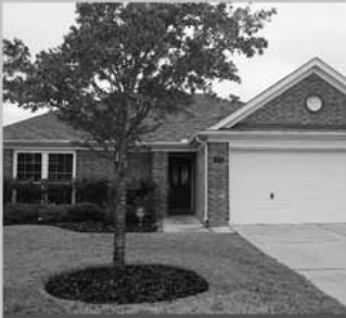
21006 OCHRE WILLOW