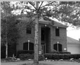
15306 JUNIPER COVE DR.

PERRY One-Story 3/2/2 Fabulous cul-de-sac lot with large backyard! Ready for quick move in.