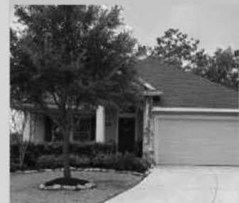
12814 MAGNOLIA ARBOR CT.