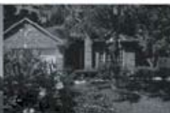
15602 Clear Point Dr. $174,900