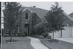
11311 Bright Canyon Lane $229,000