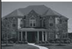
11302 Cypress Creek Lakes $574,900