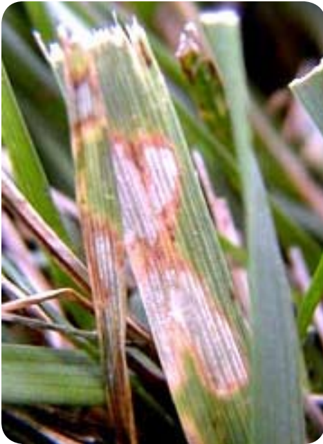
Brown Patch on Grass Blades

The summer months are usually the time we try the hardest to maintain our yard, nothing is more inviting to barbecue guests than a thick, rich lawn. Unfortunately, turf problems can be difficult to diagnose and often the most intuitive treatment can have very detrimental effects on your grass. A common problem that is often experienced in our neighborhood is Brown Patch, a soil fungus that thrives in moist environments high in nitrogen. Brown Patch can be identified by examining individual blades of grass for brown or yellow spots that look like tiny cigarette burns. Often a circular patch of brown grass will form in the lawn, sometimes with a green center where the grass has begun to recover. It should be noted that while this formation is where Brown Patch derives its name, the entire lawn will often show signs of yellow or brown grass with no distinct circular pattern.