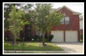
11227 Silver Rush