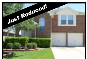
18127 Dusty Terrace - $159K