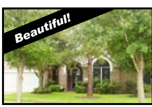
11631 Canyon Mills - $210K