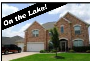
11335 Wooded Creek - $349,900