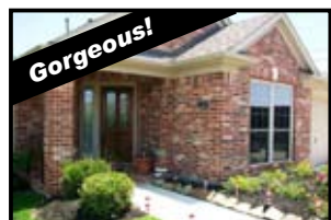
17607 Burkhard Ridge - $189,000