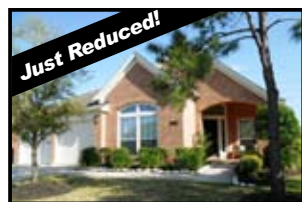
16523 Lasting Light - $159,900