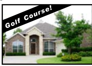
11030 Acanthus Lane - $225K