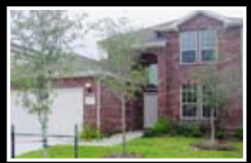
10727 Lyndon Meadows