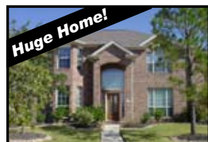
10110 Heron Meadows - $245K